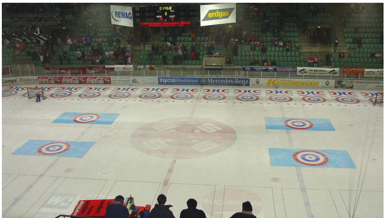
Coloured target fields at the ECh in Regensburg -