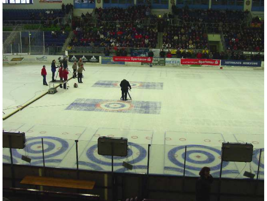
Coloured target fields at the ECh in Garmisch